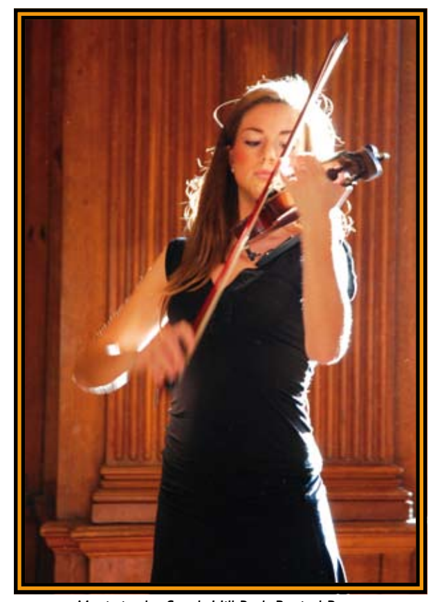
Music in the South Hill Park Recital Room